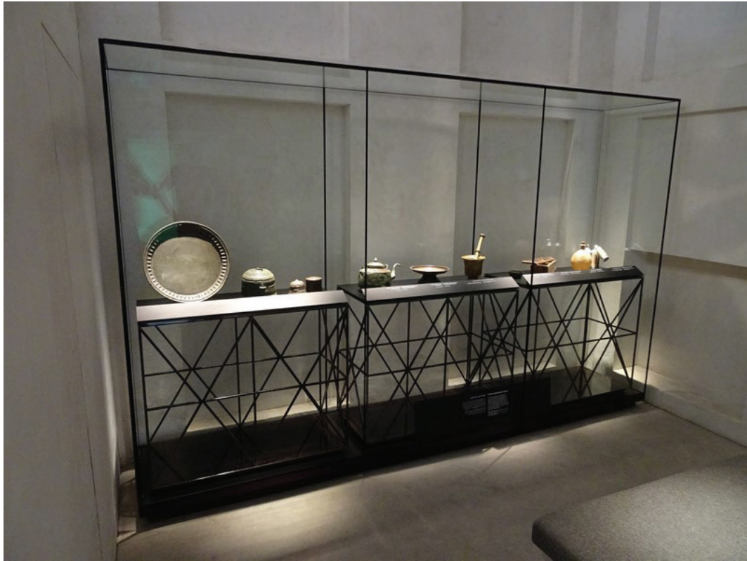
▲ Al Shindagha Museum - Perfume House - Dubai, United Arab Emirates