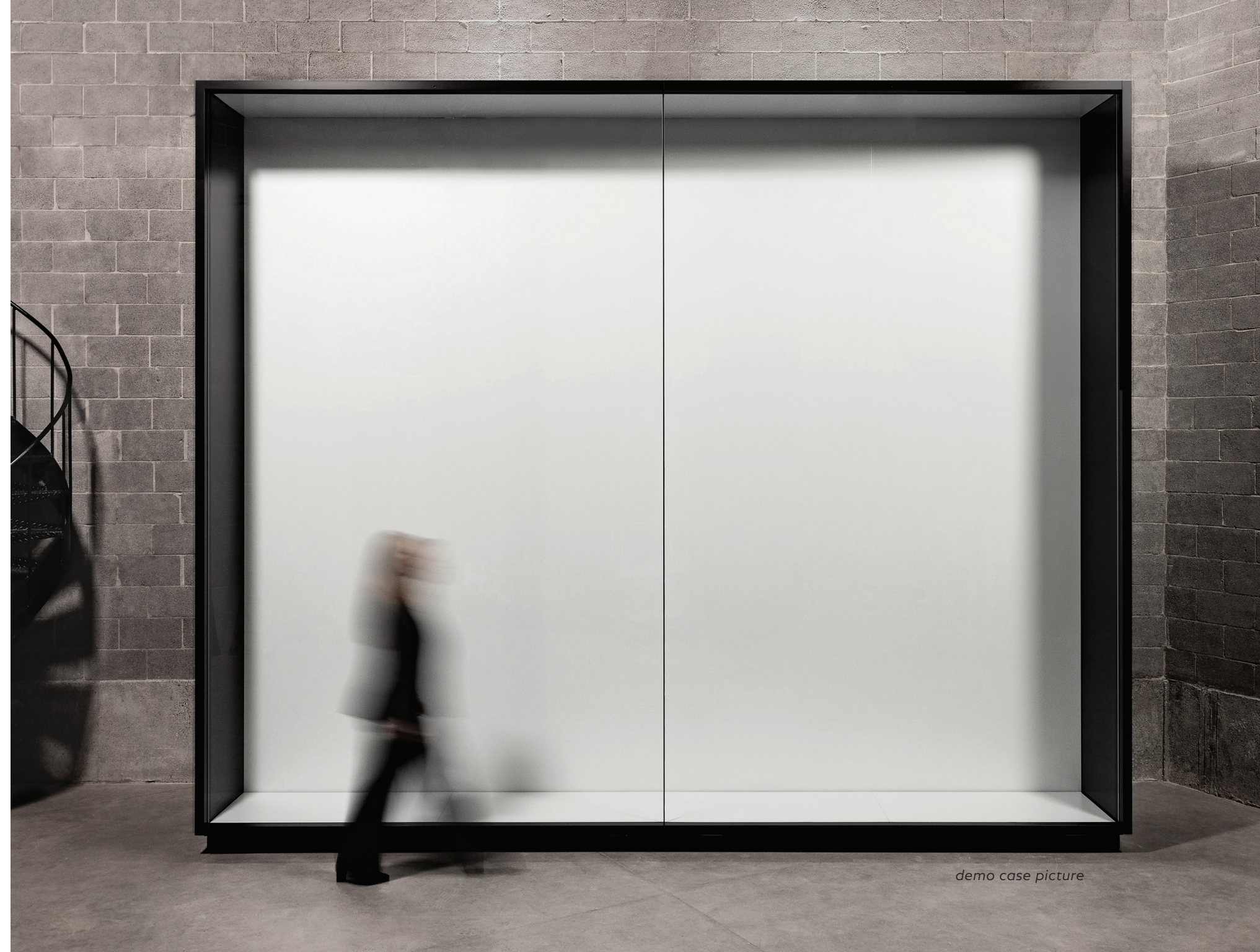
demo case picture